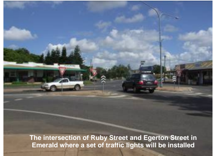
The intersection of Ruby Street and Egerton Street in Emerald where a set of traffic lights will be installed

These three intersections are some of the busiest in Emerald and the new traffic lights will improve safety for motorists and pedestrians. The lights which are being delivered as part of the Safer Roads Sooner program, will be fully installed and operational by late 2010, and will greatly benefit the Emerald community.