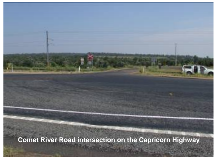
Comet River Road intersection on the Capricorn Highway

The project involves upgrading the intersection to improve safety for all motorists.